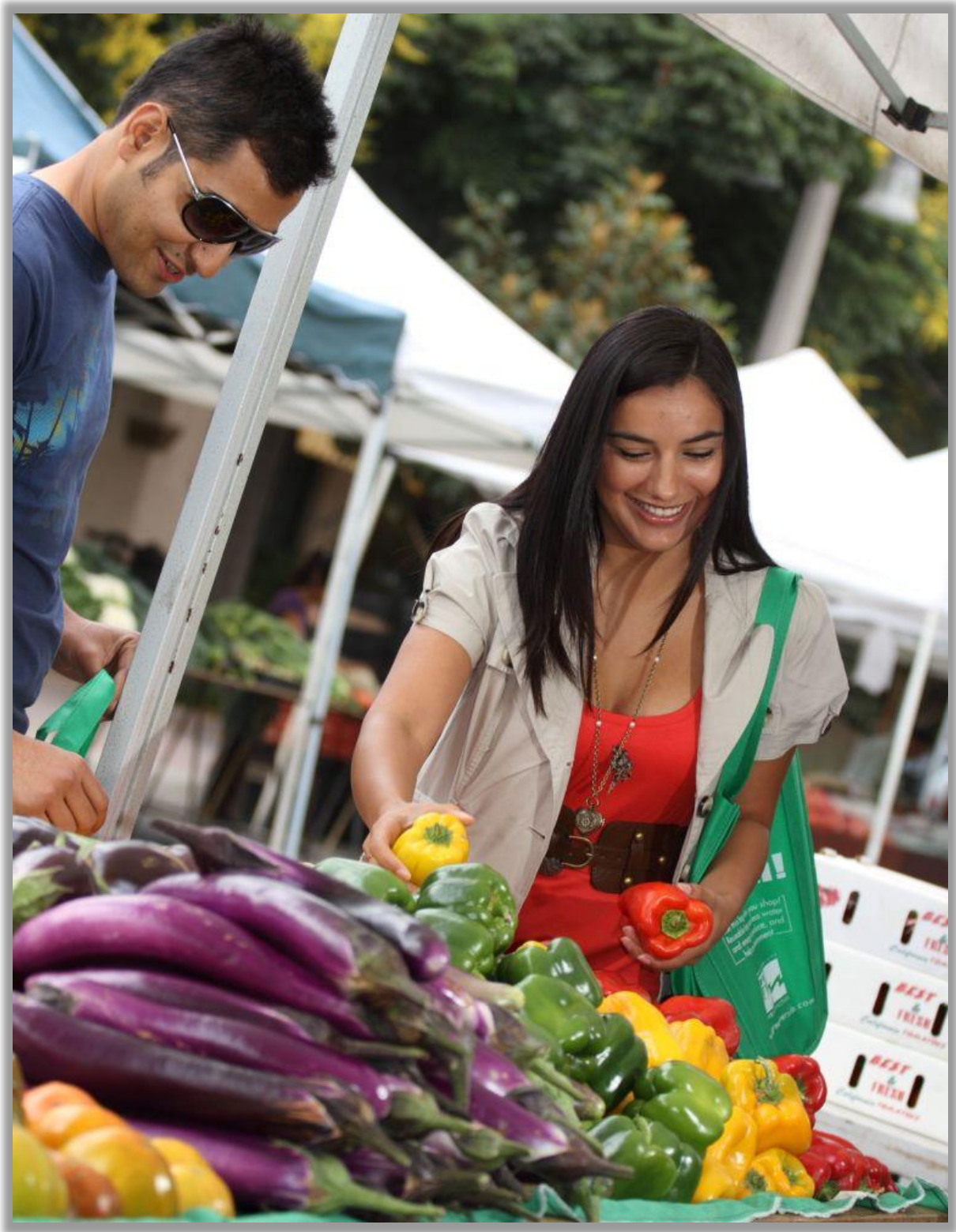
Couple shopping at Riverside's Downtown Farmers Market