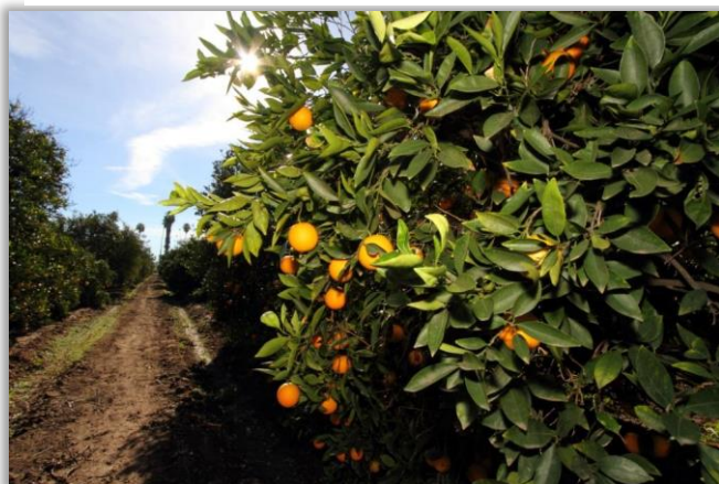
Citrus groves in the Arlington Heights Greenbelt

Key Actors: City economic development staff, food producers and distributors, institutional buyers and facilities