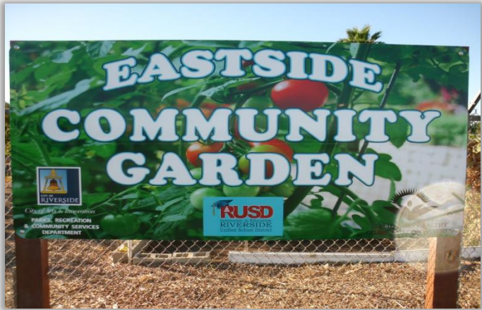
Eastside Community Garden in Riverside

education, and encouragement – and to open up the opportunity for creativity and innovation. We must continue to reshape our food system towards a healthier, more local, and more sustainable model. If we do so, the re-creation of our food system can make a huge contribution to so many important elements of our community and our planet. And all of us can lead healthier and better lives as a result!