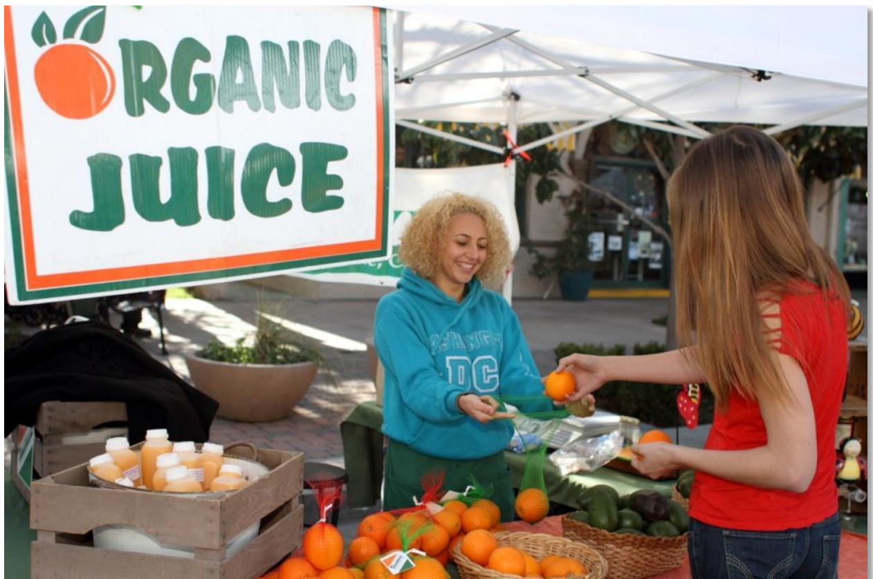
Riverside's Downtown Farmers Market on Saturdays

Key Actors: Arts Commission, Chambers, Downtown partnerships, formal and non-formal education entities, RAM, Metropolitan Museum, libraries, Citrus Heritage Park, Riverside Citizens Science