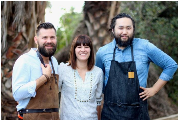
Culinary team for the March 2015 Farm-to-Fork Dinner in the Groves