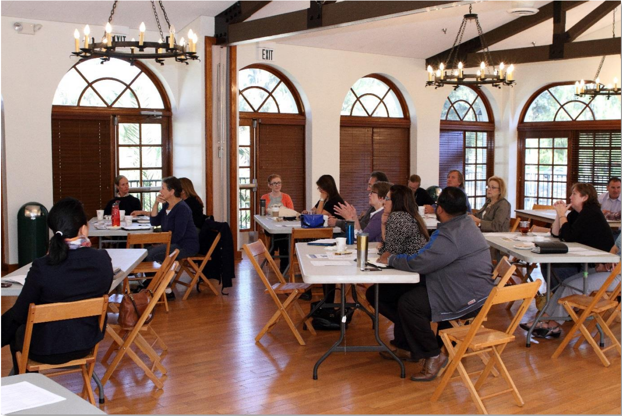
Participants from various backgrounds in one of several workshops working together to draft the Food Policy Action Plan.