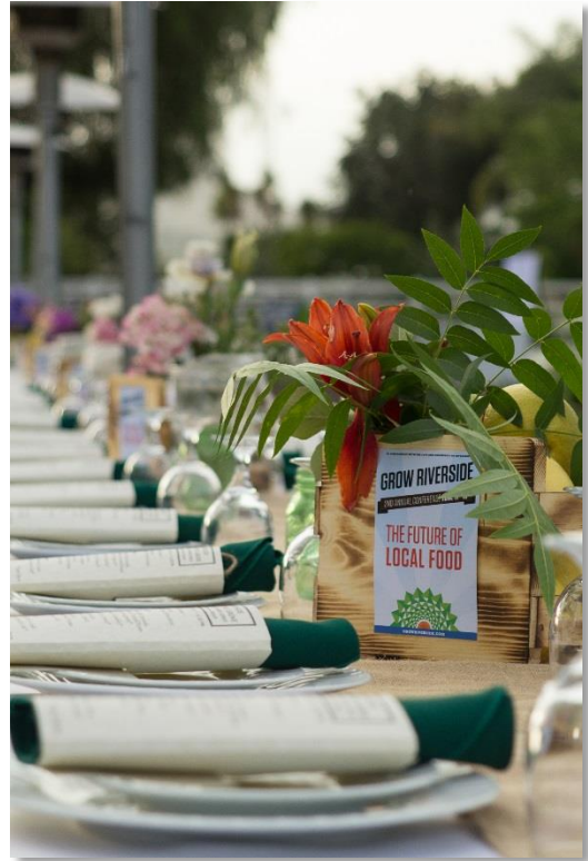
Farm-to-Fork Dinner in the groves

City staff members have noted, however, that in the past there have been several efforts to develop policies relating to concerns like the future of the Greenbelt and other food related issues, and that those initiatives wound up faltering and not producing results. They are convinced that the level of commitment and energy that is palpable in 2015 will prevent such a situation arising this time. But it is important to remember that this work is complicated and challenging, and requires significant investment of energy, patience, and resources.