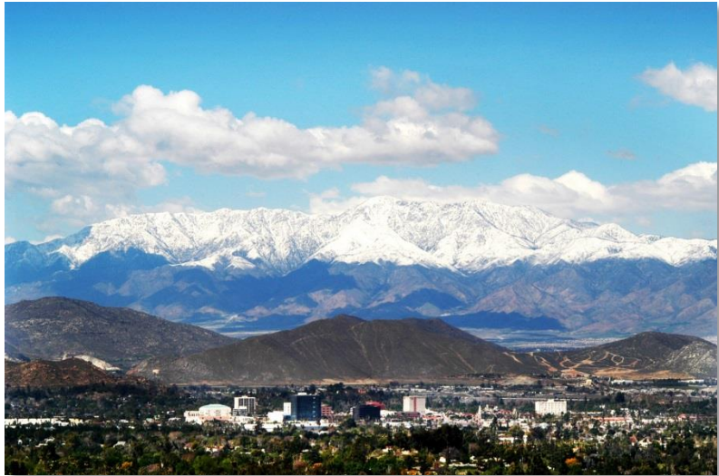
Riverside, the City of arts and innovation

The following provides a summary of the seven core areas of the Riverside Food and Agriculture Policy Action Plan, and offers recommendations that are explained in detail under 'Proposed Actions' in this document, starting on page 25.