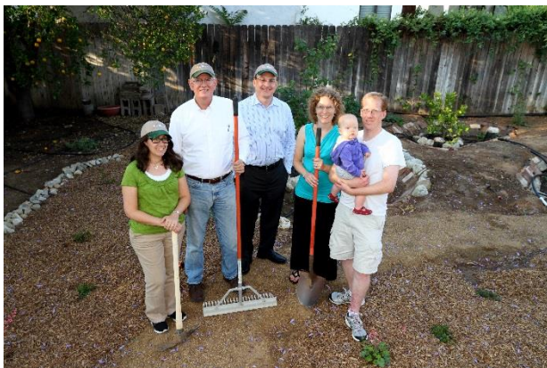
Riverside's Wood Streets Green Team