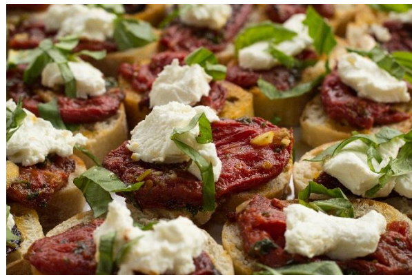
Fresh, local food served at farm-to-fork dinners