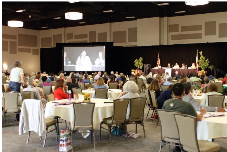
June 2015 GrowRIVERSIDE: The Future of Local Food Conference