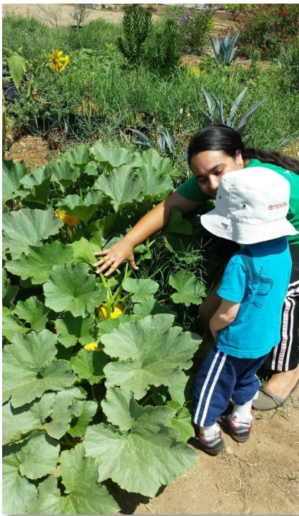
Mother and child at Tequesquite Community Garden