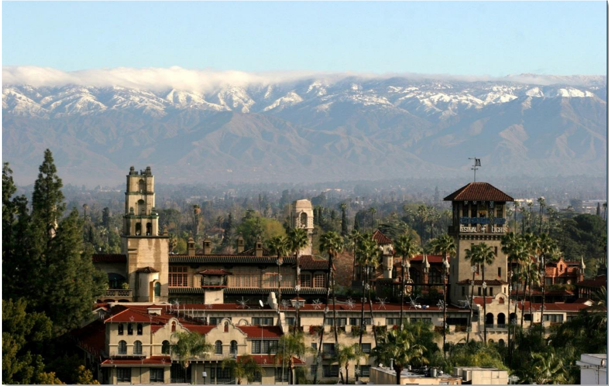
View of downtown Riverside and the Mission Inn

The City of Riverside is one of the easternmost urban communities in the Los Angeles metropolitan area. It is the last stop on a major Metrolink line to Los Angeles, and the County seat for Riverside County, which stretches an immense distance into the desert far to the east -- to Palm Springs and beyond to the Arizona border.